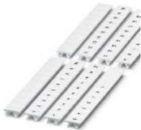
Zack marker strip, 10-section, vertically labeled with the consecutive numbers: 81 ... 90, white, width: 8 mm

Please be informed that the data shown in this PDF Document is generated from our Online Catalog. Please find the complete data in the user's documentation. Our General Terms of Use for Downloads are valid ( http://phoenixcontact.com/download )