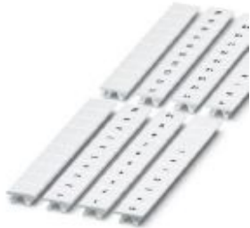
Zack marker strip, 10-section, vertically labeled with the consecutive numbers: 91 ... 100, white, width: 8 mm

Please be informed that the data shown in this PDF Document is generated from our Online Catalog. Please find the complete data in the user's documentation. Our General Terms of Use for Downloads are valid ( http://phoenixcontact.com/download )