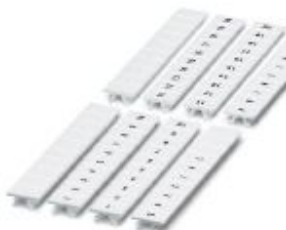
Zack marker strip, 10-section, horizontally labeled with the consecutive numbers: 1 ... 10, white, width: 6.5 mm

Please be informed that the data shown in this PDF Document is generated from our Online Catalog. Please find the complete data in the user's documentation. Our General Terms of Use for Downloads are valid ( http://phoenixcontact.com/download )