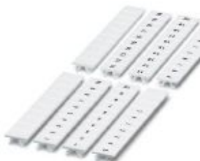
Zack marker strip, 10-section, horizontally labeled with the consecutive numbers: 31 ... 40, white, width: 6.5 mm

Please be informed that the data shown in this PDF Document is generated from our Online Catalog. Please find the complete data in the user's documentation. Our General Terms of Use for Downloads are valid ( http://phoenixcontact.com/download )