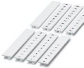
Zack marker strip, 10-section, horizontally labeled with the consecutive numbers: 41 ... 50, white, width: 6.5 mm

Please be informed that the data shown in this PDF Document is generated from our Online Catalog. Please find the complete data in the user's documentation. Our General Terms of Use for Downloads are valid ( http://phoenixcontact.com/download )