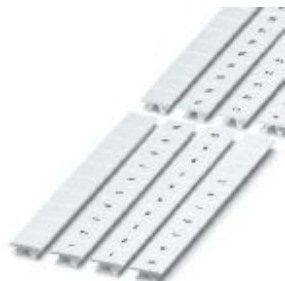
Zack marker strip, 10-section, horizontally labeled with the consecutive numbers: 21 ... 30, white

Please be informed that the data shown in this PDF Document is generated from our Online Catalog. Please find the complete data in the user's documentation. Our General Terms of Use for Downloads are valid ( http://phoenixcontact.com/download )