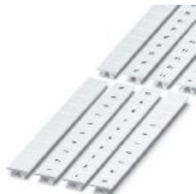
Zack marker strip, 10-section, horizontally labeled with the consecutive numbers: 41 ... 50, white

Please be informed that the data shown in this PDF Document is generated from our Online Catalog. Please find the complete data in the user's documentation. Our General Terms of Use for Downloads are valid ( http://phoenixcontact.com/download )