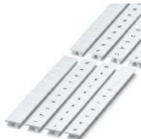
Zack marker strip, 10-section, horizontally labeled with the consecutive numbers: 81 ... 90, white

Please be informed that the data shown in this PDF Document is generated from our Online Catalog. Please find the complete data in the user's documentation. Our General Terms of Use for Downloads are valid ( http://phoenixcontact.com/download )