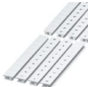
Zack marker strip, 10-section, vertically labeled with the consecutive numbers: 1 ... 10, white, width: 10 mm

Please be informed that the data shown in this PDF Document is generated from our Online Catalog. Please find the complete data in the user's documentation. Our General Terms of Use for Downloads are valid ( http://phoenixcontact.com/download )