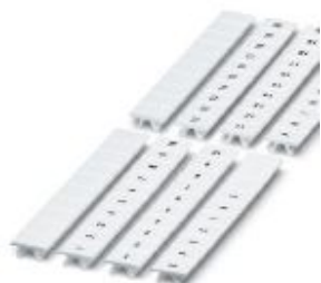
Zack marker strip, 10-section, horizontally labeled with the consecutive numbers: 1 ... 10, white, width: 7.5 mm

Please be informed that the data shown in this PDF Document is generated from our Online Catalog. Please find the complete data in the user's documentation. Our General Terms of Use for Downloads are valid ( http://phoenixcontact.com/download )