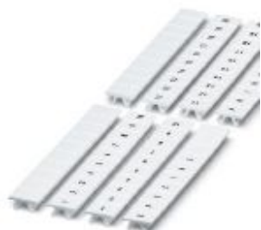
Zack marker strip, 10-section, horizontally labeled with the consecutive numbers: 71 ... 80, white, width: 7.5 mm

Please be informed that the data shown in this PDF Document is generated from our Online Catalog. Please find the complete data in the user's documentation. Our General Terms of Use for Downloads are valid ( http://phoenixcontact.com/download )