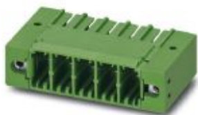
The figure shows a 5-pos. version of the product

PCB headers, nominal cross section: 6 mm 2 , color: black, nominal current: 41 A, rated voltage (III/2): 630 V, contact surface: Tin, type of contact: Male connector, Number of rows: 1, Number of positions per row: 5, product range: PC 5/..-GF, pitch: 7.62 mm, mounting: Wave soldering, Stecksystm: POWER COMBICON 5, Locking: Screw locking