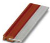
Plug-in bridge, length: 50 mm, color: red

Plug-in bridge - FBST 50-PLC RD - 1081050