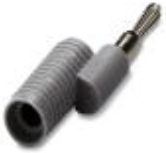
Reducing plug, color: gray