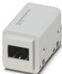
Contact insert, number of positions: RJ45, size: D7, type : RJ45, Pin, 50 V, 1 A, application: Data, with adapter for RJ industrial connector

Please be informed that the data shown in this PDF Document is generated from our Online Catalog. Please find the complete data in the user's documentation. Our General Terms of Use for Downloads are valid ( http://phoenixcontact.com/download )