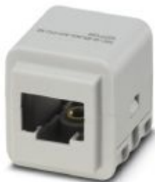
Contact insert, number of positions: RJ45, size: D7, type : RJ45, Pin, 50 V, 1 A, application: Data, with adapter for patch cables

Please be informed that the data shown in this PDF Document is generated from our Online Catalog. Please find the complete data in the user's documentation. Our General Terms of Use for Downloads are valid ( http://phoenixcontact.com/download )