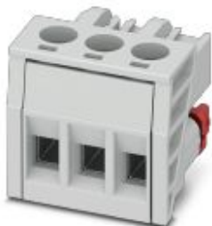
PCB connector, number of positions: 3, connection method: Screw connection with tension sleeve, color: light gray

Please be informed that the data shown in this PDF Document is generated from our Online Catalog. Please find the complete data in the user's documentation. Our General Terms of Use for Downloads are valid ( http://phoenixcontact.com/download )