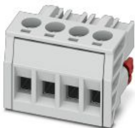
PCB connector, number of positions: 4, pitch: 5 mm, color: light gray

Please be informed that the data shown in this PDF Document is generated from our Online Catalog. Please find the complete data in the user's documentation. Our General Terms of Use for Downloads are valid ( http://phoenixcontact.com/download )