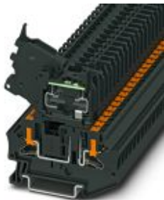
Lever-type fuse terminal block, black, for 5 x 20 mm G fuse inserts, with LED for 24 V DC

Please be informed that the data shown in this PDF Document is generated from our Online Catalog. Please find the complete data in the user's documentation. Our General Terms of Use for Downloads are valid ( http://phoenixcontact.com/download )