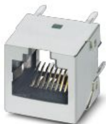
RJ45 PCB connectors, type: RJ45, degree of protection: IP20, number of positions: 8, 10 Gbps, connection method: Solder connection

Please be informed that the data shown in this PDF Document is generated from our Online Catalog. Please find the complete data in the user's documentation. Our General Terms of Use for Downloads are valid ( http://phoenixcontact.com/download )