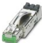
RJ45 connector - CUC-IND-C1ZNI-S/R4QV6 - 1406335

RJ45 connector, degree of protection: IP20, number of positions: 6, 100 Mbps, CAT5 (IEC 11801:2002), material: Zinc die-cast, connection method: IDC fast connection, connection cross section: AWG 26- 24, cable outlet: straight, High degree of resistance to vibration; 360° shielding; one-piece design; special tool-free assembly