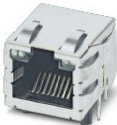
RJ45 PCB connectors, type: RJ45, degree of protection: IP20, number of positions: 8, 10 Gbps, connection method: Solder connection

Please be informed that the data shown in this PDF Document is generated from our Online Catalog. Please find the complete data in the user's documentation. Our General Terms of Use for Downloads are valid ( http://phoenixcontact.com/download )