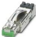
RJ45 connector - CUC-IND-C1ZNI-S/R4IP8 - 1421126

RJ45 connector, degree of protection: IP20, number of positions: 8, 1 Gbps, CAT5 (IEC 11801:2002), material: Zinc die-cast, connection method: IDC fast connection, connection cross section: AWG 23- 22, cable outlet: straight, color: green