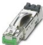
RJ45 connector - CUC-IND-C1ZNI-S/R4IE8 - 1421607

RJ45 connector, degree of protection: IP20, number of positions: 8, 1 Gbps, CAT5 (IEC 11801:2002), material: Zinc die-cast, connection method: IDC fast connection, connection cross section: AWG 26- 24, cable outlet: straight, color: green