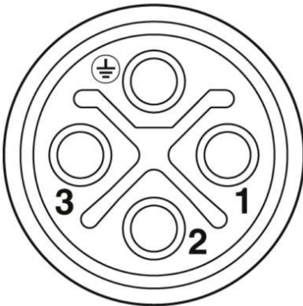
Pin assignment of M12 socket, 4-pos., S-coded, socket side view