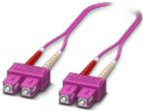
Multi-mode OM4 duplex jumper, SC-SC, UPC polishing, length 5 m

Please be informed that the data shown in this PDF Document is generated from our Online Catalog. Please find the complete data in the user's documentation. Our General Terms of Use for Downloads are valid ( http://phoenixcontact.com/download )