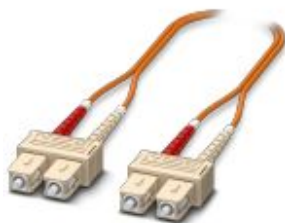
Multi-mode OM2 duplex jumper, SC-SC, UPC polishing, length 2 m

Please be informed that the data shown in this PDF Document is generated from our Online Catalog. Please find the complete data in the user's documentation. Our General Terms of Use for Downloads are valid ( http://phoenixcontact.com/download )