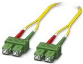
Single-mode OS2 duplex jumper, SC-SC, APC polishing, length 2 m

Please be informed that the data shown in this PDF Document is generated from our Online Catalog. Please find the complete data in the user's documentation. Our General Terms of Use for Downloads are valid ( http://phoenixcontact.com/download )