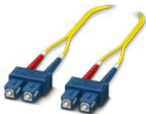
Single-mode OS2 duplex jumper, SC-SC, UPC polishing, length 5 m

Please be informed that the data shown in this PDF Document is generated from our Online Catalog. Please find the complete data in the user's documentation. Our General Terms of Use for Downloads are valid ( http://phoenixcontact.com/download )