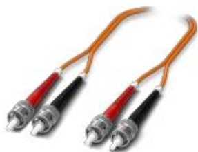
Multi-mode OM2 duplex jumper, ST-ST, UPC polishing, length 5 m

Please be informed that the data shown in this PDF Document is generated from our Online Catalog. Please find the complete data in the user's documentation. Our General Terms of Use for Downloads are valid ( http://phoenixcontact.com/download )