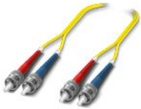
Single-mode OS2 duplex jumper, ST-ST, UPC polishing, length 5 m

Please be informed that the data shown in this PDF Document is generated from our Online Catalog. Please find the complete data in the user's documentation. Our General Terms of Use for Downloads are valid ( http://phoenixcontact.com/download )