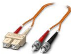
Multi-mode OM2 duplex jumper, ST-SC, UPC polishing, length 2 m

Please be informed that the data shown in this PDF Document is generated from our Online Catalog. Please find the complete data in the user's documentation. Our General Terms of Use for Downloads are valid ( http://phoenixcontact.com/download )