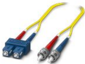
Single-mode OS2 duplex jumper, ST-SC, UPC polishing, length 1 m

Please be informed that the data shown in this PDF Document is generated from our Online Catalog. Please find the complete data in the user's documentation. Our General Terms of Use for Downloads are valid ( http://phoenixcontact.com/download )