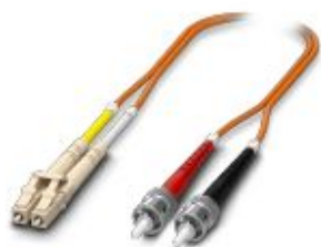
Multi-mode OM2 duplex jumper, LC-ST, UPC polishing, length 2 m

Please be informed that the data shown in this PDF Document is generated from our Online Catalog. Please find the complete data in the user's documentation. Our General Terms of Use for Downloads are valid ( http://phoenixcontact.com/download )