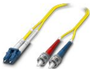
Single-mode OS2 duplex jumper, LC-ST, UPC polishing, length 5 m

Please be informed that the data shown in this PDF Document is generated from our Online Catalog. Please find the complete data in the user's documentation. Our General Terms of Use for Downloads are valid ( http://phoenixcontact.com/download )