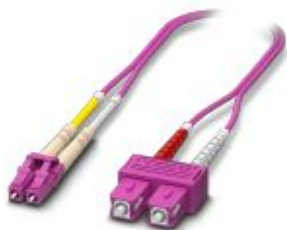
Multi-mode OM4 duplex jumper, LC-SC, UPC polishing, length 5 m

Please be informed that the data shown in this PDF Document is generated from our Online Catalog. Please find the complete data in the user's documentation. Our General Terms of Use for Downloads are valid ( http://phoenixcontact.com/download )