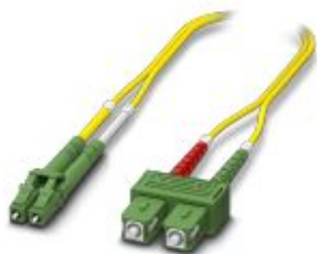
Single-mode OS2 duplex jumper, LC-SC, APC polishing, length 5 m

Please be informed that the data shown in this PDF Document is generated from our Online Catalog. Please find the complete data in the user's documentation. Our General Terms of Use for Downloads are valid ( http://phoenixcontact.com/download )