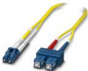
Single-mode OS2 duplex jumper, LC-SC, UPC polishing, length 2 m

Please be informed that the data shown in this PDF Document is generated from our Online Catalog. Please find the complete data in the user's documentation. Our General Terms of Use for Downloads are valid ( http://phoenixcontact.com/download )