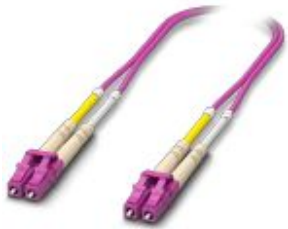
Multi-mode OM4 duplex jumper, LC-LC, UPC polishing, length 2 m

Please be informed that the data shown in this PDF Document is generated from our Online Catalog. Please find the complete data in the user's documentation. Our General Terms of Use for Downloads are valid ( http://phoenixcontact.com/download )