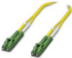
Single-mode OS2 duplex jumper, LC-LC, APC polishing, length 0.5 m

Please be informed that the data shown in this PDF Document is generated from our Online Catalog. Please find the complete data in the user's documentation. Our General Terms of Use for Downloads are valid ( http://phoenixcontact.com/download )