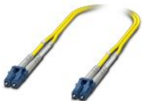
Single-mode OS2 duplex jumper, LC-LC, UPC polishing, length 2 m

Please be informed that the data shown in this PDF Document is generated from our Online Catalog. Please find the complete data in the user's documentation. Our General Terms of Use for Downloads are valid ( http://phoenixcontact.com/download )