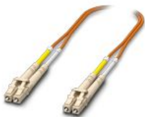
Multi-mode OM2 duplex jumper, LC-LC, UPC polishing, length 2 m

Please be informed that the data shown in this PDF Document is generated from our Online Catalog. Please find the complete data in the user's documentation. Our General Terms of Use for Downloads are valid ( http://phoenixcontact.com/download )