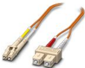
Multi-mode OM1 duplex jumper, LC-SC, UPC polishing, length 5 m

Please be informed that the data shown in this PDF Document is generated from our Online Catalog. Please find the complete data in the user's documentation. Our General Terms of Use for Downloads are valid ( http://phoenixcontact.com/download )