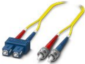
Single-mode OS2 duplex jumper, ST-SC, UPC polishing, length 10 m

Please be informed that the data shown in this PDF Document is generated from our Online Catalog. Please find the complete data in the user's documentation. Our General Terms of Use for Downloads are valid ( http://phoenixcontact.com/download )