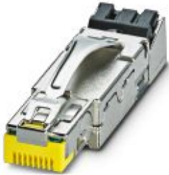
RJ45 connector, IP20, CAT6 A , 8-pos., with IDC fast connection technology, for AWG 23 - 22 1-wire, 7-wire, and 19-wire conductors

Please be informed that the data shown in this PDF Document is generated from our Online Catalog. Please find the complete data in the user's documentation. Our General Terms of Use for Downloads are valid ( http://phoenixcontact.com/download )