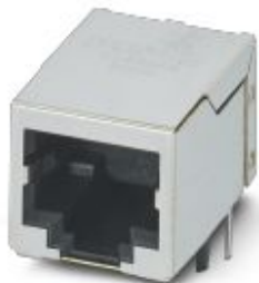
RJ45 PCB connectors, degree of protection: IP20, 10 Gbps

Please be informed that the data shown in this PDF Document is generated from our Online Catalog. Please find the complete data in the user's documentation. Our General Terms of Use for Downloads are valid ( http://phoenixcontact.com/download )