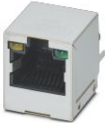
RJ45 PCB connectors, degree of protection: IP20, 10 Gbps

Please be informed that the data shown in this PDF Document is generated from our Online Catalog. Please find the complete data in the user's documentation. Our General Terms of Use for Downloads are valid ( http://phoenixcontact.com/download )