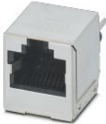
RJ45 PCB connectors, degree of protection: IP20, 10 Gbps

Please be informed that the data shown in this PDF Document is generated from our Online Catalog. Please find the complete data in the user's documentation. Our General Terms of Use for Downloads are valid ( http://phoenixcontact.com/download )