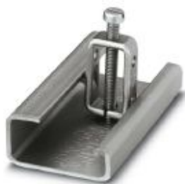
End clamp, width: 8 mm

Please be informed that the data shown in this PDF Document is generated from our Online Catalog. Please find the complete data in the user's documentation. Our General Terms of Use for Downloads are valid ( http://phoenixcontact.com/download )