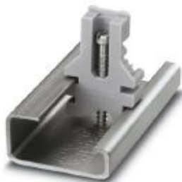
End clamp, width: 8.5 mm, color: gray

Please be informed that the data shown in this PDF Document is generated from our Online Catalog. Please find the complete data in the user's documentation. Our General Terms of Use for Downloads are valid ( http://phoenixcontact.com/download )