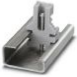
End clamp, width: 8.5 mm, color: gray

Phoenix Contact 2020 © - all rights reserved http://www.phoenixcontact.com