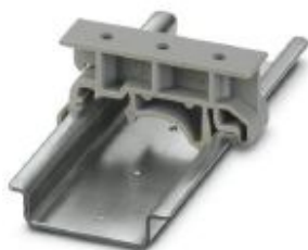
Rail adapters, for M3 screws, length: 42.6 mm, width: 10 mm, height: 19 mm, color: gray

Please be informed that the data shown in this PDF Document is generated from our Online Catalog. Please find the complete data in the user's documentation. Our General Terms of Use for Downloads are valid ( http://phoenixcontact.com/download )