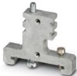
End clamp, for end support of terminal blocks, for mounting on NS 32 or NS 35/7.5 DIN rails, material: Aluminum, width: 8 mm

Please be informed that the data shown in this PDF Document is generated from our Online Catalog. Please find the complete data in the user's documentation. Our General Terms of Use for Downloads are valid ( http://phoenixcontact.com/download )