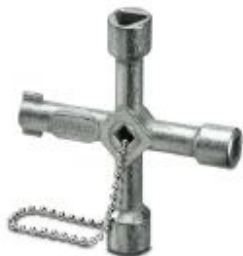
Control cabinet key, metal, for all common types of control cabinet

Please be informed that the data shown in this PDF Document is generated from our Online Catalog. Please find the complete data in the user's documentation. Our General Terms of Use for Downloads are valid ( http://phoenixcontact.com/download )